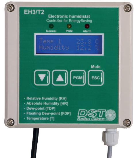
EH3 T2 with back-lit display, available from Seibu Giken DST only

Sensor: Capacitive type moisture sensor from Honeywell with an accuracy of <\pm 2\% RH and <\pm 0.5^\circ C. Each sensor comes with a calibration protocol.