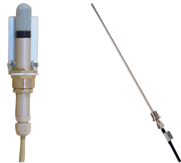
Humidity- and temperature sensor from Honeywell (standard)