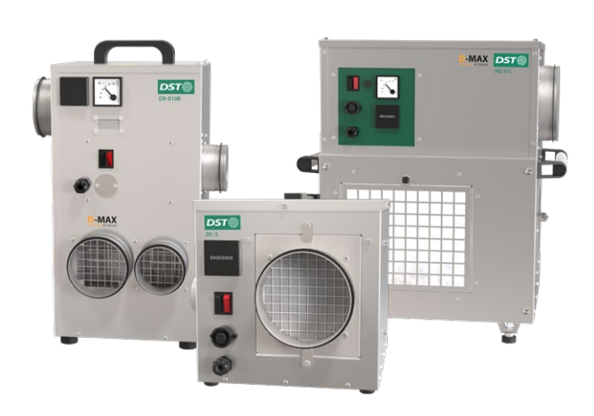
Stainless steel dehumidifiers from Seibu Giken DST. From left DR-010B, DC-5, AQ-31L