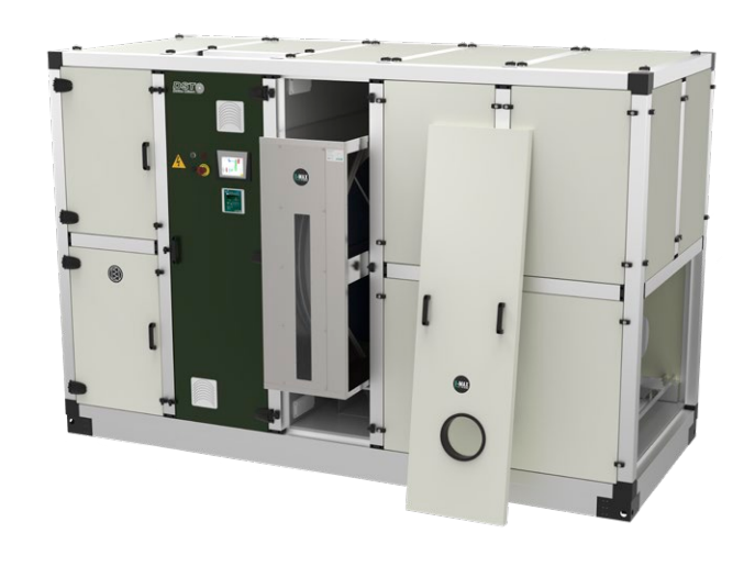
Flexisorb unit CF-192

DST is a Swedish company, founded in 1985. We are now a leading international supplier of desiccant dehumidifiers. DST has been a subsidiary of Japanese company Seibu Giken Co Ltd since 1993. DST is currently represented in over 40 countries throughout the world. Seibu Giken Co manufactures dehumidifier rotors, VOC rotors, heat exchangers and more.