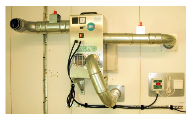
A DR-010B with DST humidistat EH4 controls moisture at a booster station

There was an improvement once the dehumidifiers had been installed in the stations. Condensation no longer drips from the pipes, documents for notes in the rooms