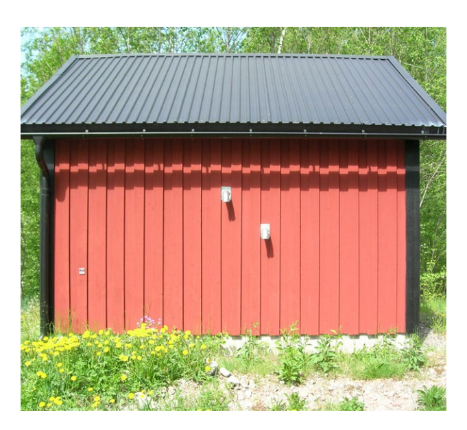
Wet air is fed out outside the booster station and regeneration air enters