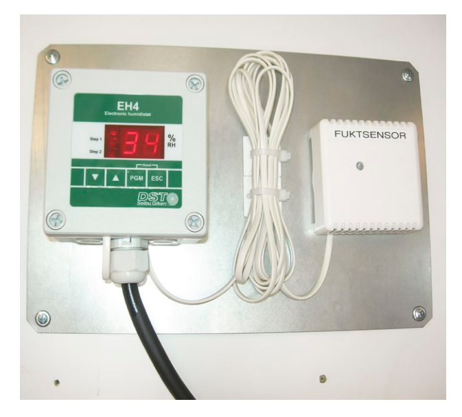
EH4, elektronic humidistat with fast response capacitive type moisture sensor

Condensation is essentially impossible to remove by heating or venting. Sorption dehumidifiers work just as efficiently in the summer as during the colder winter months; unlike condensation dehumidifiers, which loose capacity below 15°C.